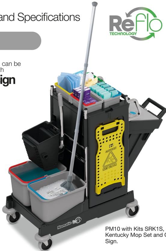
PM10 with Kits SRK1S, SRK21, DTK1 Kentucky Mop Set and Optional Wet Floor Sign.

Consumables for illustration purposes only.