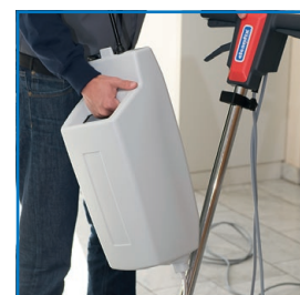
Easy mounting and demounting of the solution tank (optional)