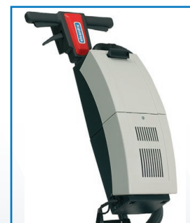
Vacuum unit AS 05 (optional)